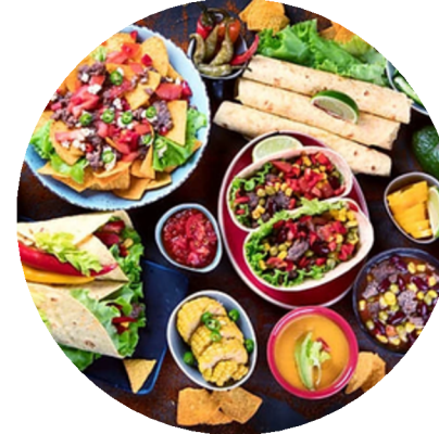
TEX MEX FOOD TRUCK