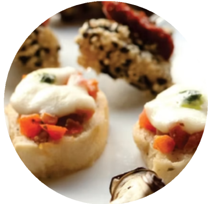
PASS AROUND APPETIZERS