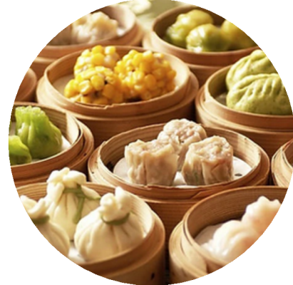
DIM SUM STATION