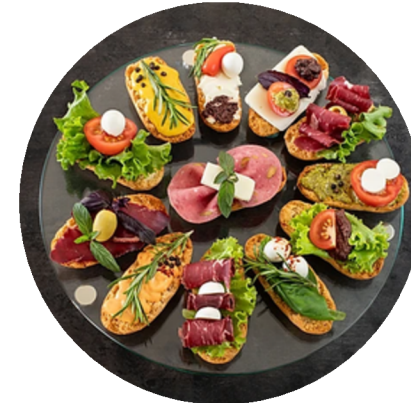
SPANISH TAPAS & PINTXOS